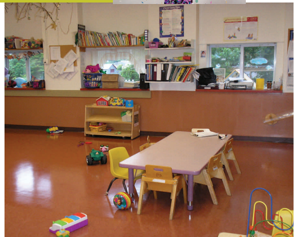
Classroom improvements at the Monument Square Center